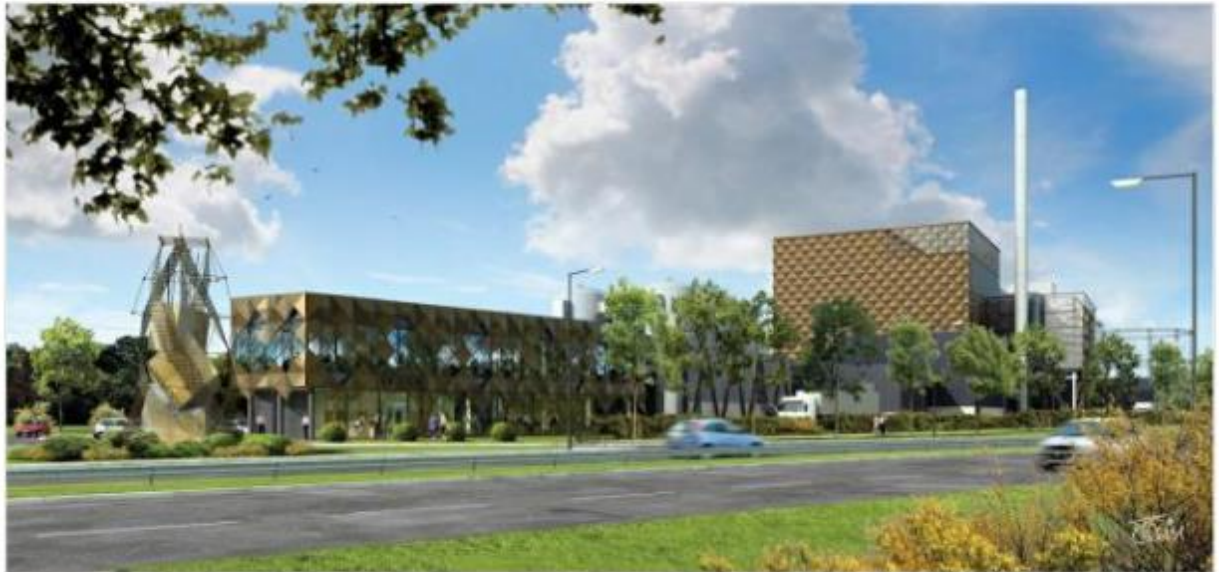
An artists' impression of the new Marley plant